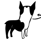
"PEACE!" look away/head turn