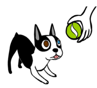
"READY!" prey bow