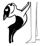
"I'M FRIENDLY!" play bow