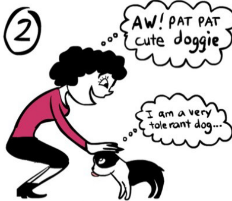
DON'T Lean over the dog & stick your hand on top of his head