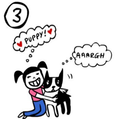
DON'T Grab or Hug him