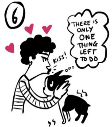
DON'T Grab his head and kiss it (This is an invasion of space)

Doing this to a dog who doesn't know you is like a perfect stranger giving you a great big hug and kiss in an elevator. Wouldn't that creep you out? And wouldn't you have the right to defend yourself?