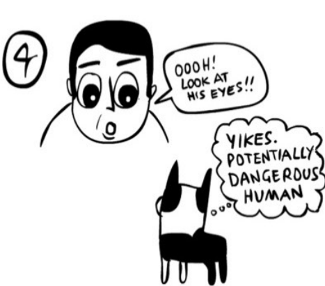
DON'T Stare him in the eye (This is an adversarial gesture)