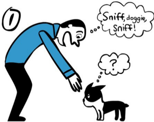
DON'T Lean over the dog & stick your hand in his face

I don't care how cute you (or your kid) think Boogie is. Please show him some respect.