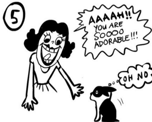
DON'T Squeal or shout in his face